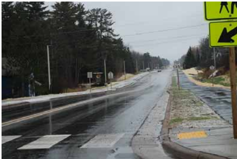
SHARED USE TRAIL AND CROSSINGS