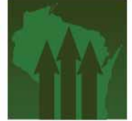
STAND ALONE TRAIL