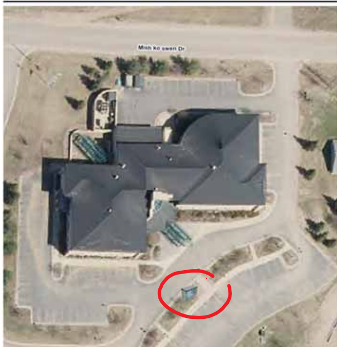
Health & Wellness Bus Stop